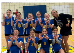
6 th Grade

The Bobcat volleyball teams swept the County volleyball tournaments in 6 th , 7 th and 8 th grade. Our 6 th grade team took the tournament on their home floor at the Sonora tournament, with our 7 th and 8 th taking the title at the Columbia tournament. Congratulations to all of our players and coaches for a successful season of bump, set, and spike!