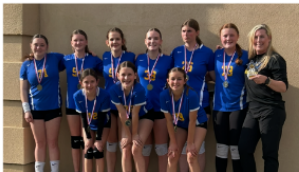
7 th Grade