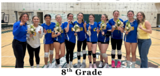
8 th Grade