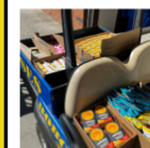
State testing snack cart rolled out this week, providing nutritious testing sessions.

On Tuesday, last week, our 6 th grade students had a wonderful experience at the theater, with a performance of the Wizard of Oz at Summerville High, presented by Connections Visual & Performing Arts Academy.