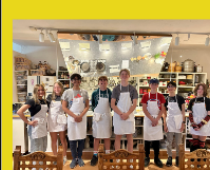
7 th and 8 th Grade G.A.T.E students learning culinary arts at Yankee Hill Cooking School

On Friday, SES hosted our Honor Roll Assemblies for 5 th -8 th Grade, with 150 students acknowledged for their academic success in the 2 nd Trimester. We also want to acknowledge Black Oak Casino for donating 150 $10 bowling certificates, going to each student who made Honor Roll. It is nice to recognize their hard work!