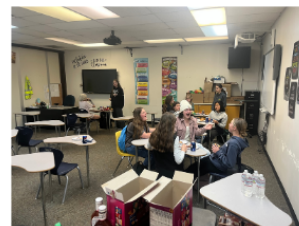
8th Grade Brilliant Bobcats having a laugh.