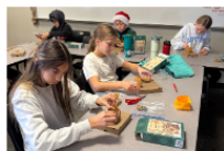
Mrs. Emerald/Gray's class designing and building their own gingerbread house.