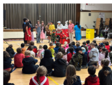
Summerville High's presentation of Charlie Brown Christmas for our TK-3rd graders.