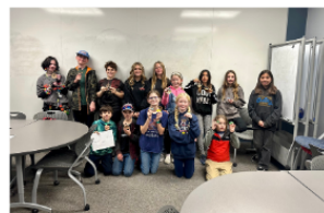
G.A.T.E. students designed and etched wood ornaments and created name tags using 3D pens.