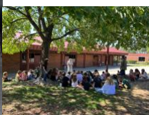
Mr. Boyles reading The Energy Bus For Kids, with a message of positivity.