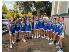
7th Grade Girls Championship Team

Girls Basketball and Co-Ed Cross Country are in full swing.