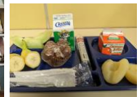
Rocky Cinnamon Bread Breakfast