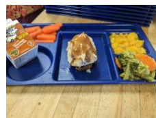
Meatloaf/Mashed Potato 'Cupcake'

Check out some examples of the amazing selections from this past month in our cafeteria: